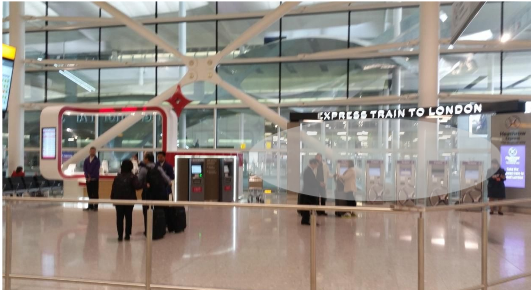
View upon arriving into Terminal 2 and the location of your driver.

Once you leave the baggage collection area after a short walk, you will enter the arrivals hall. Once there, your Airport Lynx chauffeur will meet you by the "Express trains to London" sign which is in front of you as you enter the arrivals hall and is next to the Travelex.